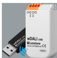
AA1100166 USB Stick + Interface Module for FFECT Program AA1100166