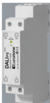
AA1100167 DALI PS1 for FFECT Program AA1100167