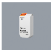
AA1100164 DALI CDC for FFECT Program AA1100164