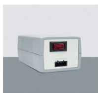
AA1100155 NeoLink Box and App for FFECT Program AA1100155