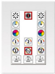
AA1100170 DALI Touch Panel for FFECT Program AA1100170