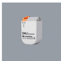
AA1100165 DALI Sequencer for FFECT Program AA1100165