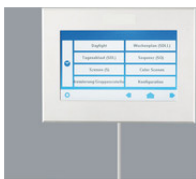
AA1100169 DALI Display 7" for FFECT Program AA1100169